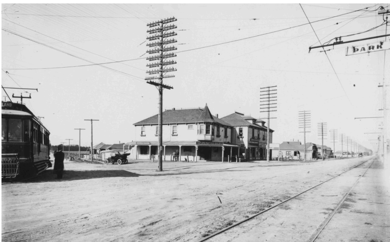
Stege Junction and streetcar at the intersection of San Pablo Avenue and Potrero Avenue, El Cerrito (1915)