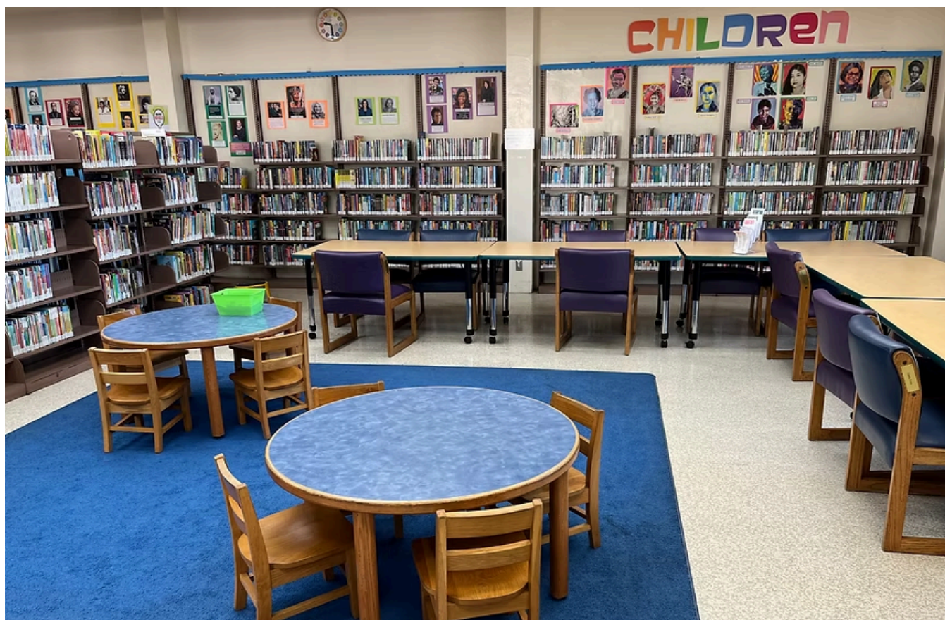
Inside the existing El Cerrito library at 6510 Stockton Avenue; picture courtesy of Betsy Bashor and liveableelcerrito.org

And that optimism is well worth the cost!